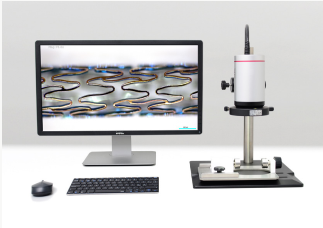
U50s with Slider-plate Stable Stand and Ring Light for High-Magnification Applications