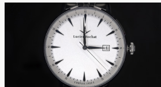
Forensic, x8 Zoom, 15x Mag.