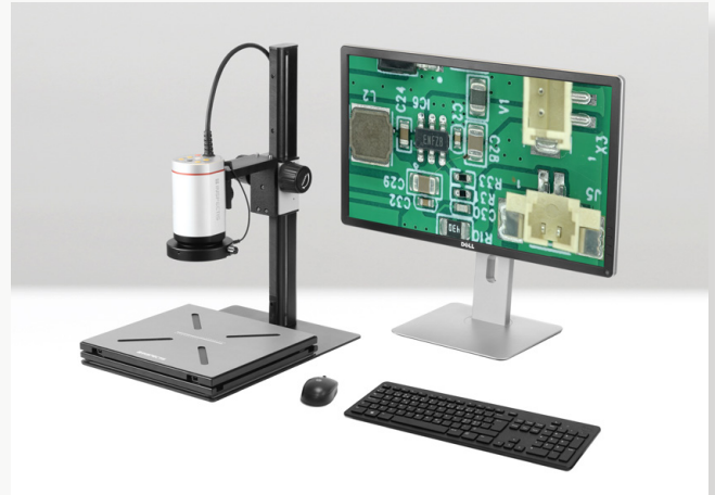
U50s with Track Stand, Floating Board and Ring Light for Advanced Optical Inspection