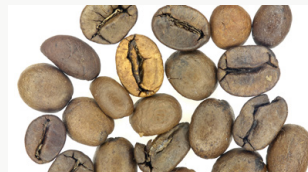
Coffee beans, x10 Zoom, 25x Mag.